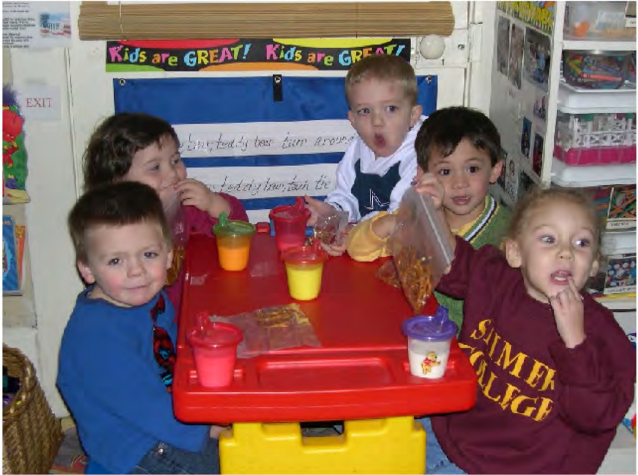
Daycare children enjoying a nutritious snack